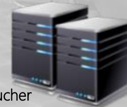
Ticket / Voucher Validation System or Central Server